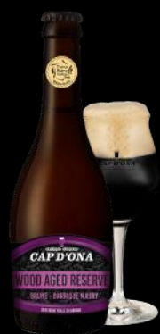
BROWN GRANDE RESERVE MAURY