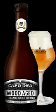
BLOND GRAND CRU CHARDONNAY