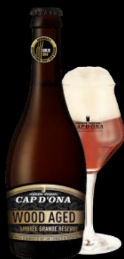
AMBER GRANDE RESERVE RIVESALTES