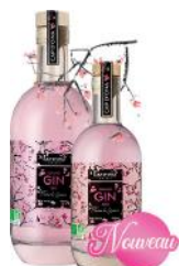
ORGANIC GIN ROSÉ «Cherry blossom» Eastern style