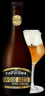
BLOND GRAND CRU PINOT NOIR

These multi gold medaled gems invite you: To an initiatory journey into the world of exceptional beers; a fairy tale for senses.