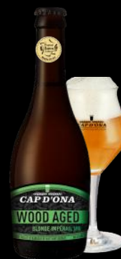
BLOND IMPERIAL IPA