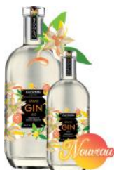
ORGANIC GIN «Citrus Freshness» Botanicals and Citrus peels