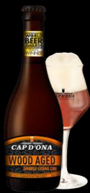
AMBER GRAND CRU PINOT NOIR