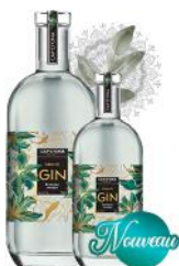
GRAND GIN «Cap de Dona» Wild botanicals

The quintessence of CAP D'ONA creations, our spirits are the result of the distillation of a selection of our beers and other great cereals produced by us. The quality of our alcohols lies in our standards: selection of the finest possible materials, slow brewing and double distillation as well as long aging in natural sweet wine barrels. We systematically retain only the ultra-core of distillation in order to ensure the Excellence and Precellence of great spirits.