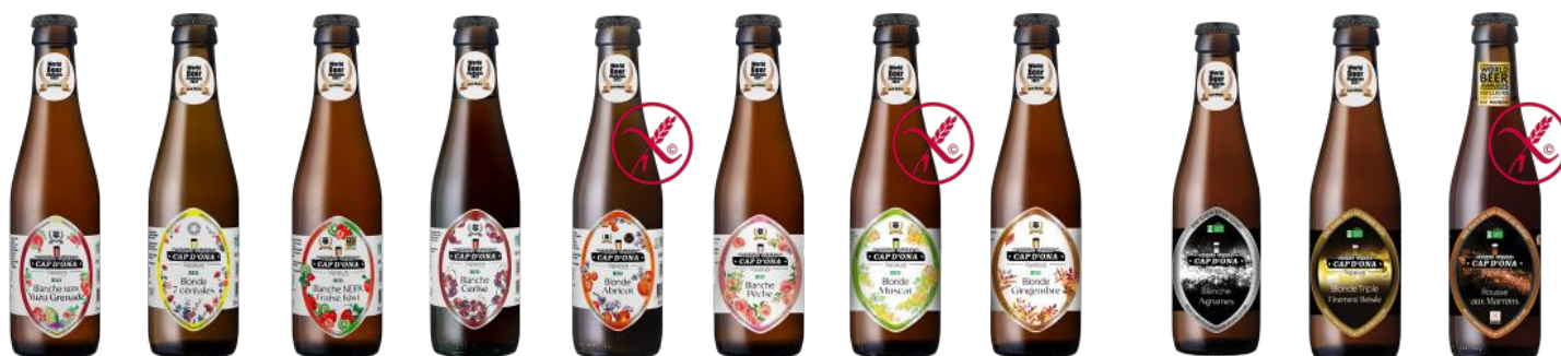
NEIPA YUZU POMEGRANATE WHITE

Pleasure beers of rare nobility. Produced in limited series, they highlight the seasons, our beautiful terroir and French treasures. All our fruit beers are made from one kilo of local seasonal organic fruit for one liter of brewed beer. Ephemeral creations, 100% natural.