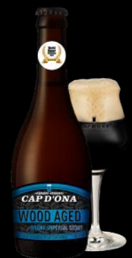
BROWN IMPERIAL STOUT