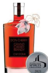
CHERRY SPIRIT «Don Cherry» Organic cherries from Céret