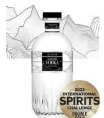
BARLEY MALT VODKA «Mal de Cap» with 7 cereals