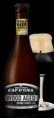
BROWN GRAND CRU PINOT NOIR